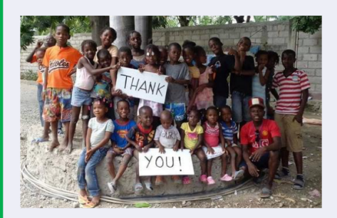
All financial donations go directly to purchasing and filling their backpacks. There are no administration fees or payroll to eat up your donation.

We thank you for your continued support and generous donations. All of you are invaluable to this ministry and we would not be able to continue if not for you.