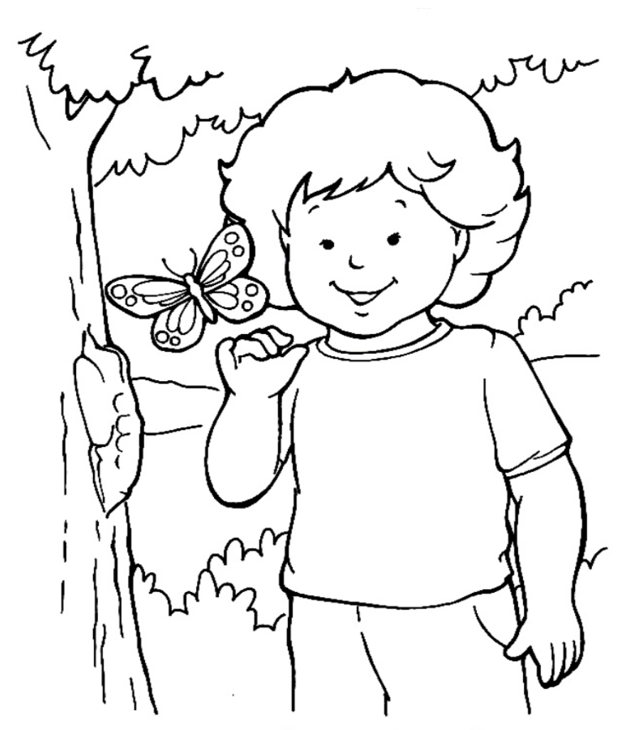
Jesus is special. He can do miracles.

From Thru-the-Bible Coloring Pages for Ages 4-8. © 1986,1988 Standard Publishing. Used by permission. Reproducible Coloring Books may be purchased from Standard Publishing, www.standardpub.com